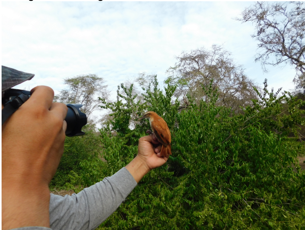
The Pale-legged Hornero in the Cañoncillo Forest (Image: C. Flores, December 2020)

One of our research priorities of the Libertad Dry Forest Project is to determine and monitor the key species of flora and fauna in the Cañoncillo and other dry forest areas. Through researching endemic flora and fauna, we raise awareness of the conservation priorities of the region and monitor their use of the habitat. The Cañoncillo Forest is very important because it is the only area with the largest number of Algarrobo tree species in La Libertad, protecting it ensures the continuity of the ecological and evolutionary processes within the forest area, as well as avoiding the extinction of wild flora and fauna species. READ MORE