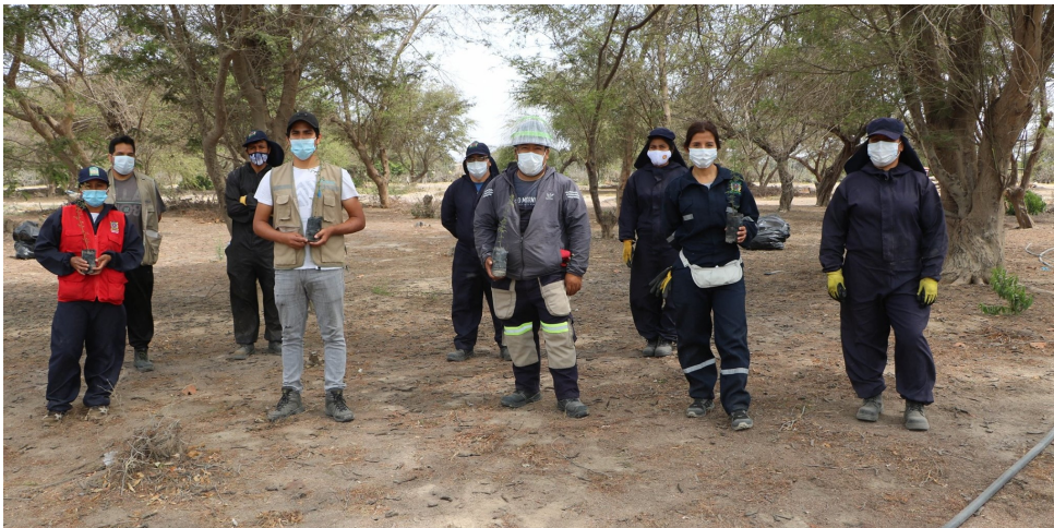
Reforestation with the Municipalidad Provincial de Pacasmayo

A Rocha Peru has completed its third year of the La Libertad Dry Forest Project in Pacasmayo. We are delighted that the project has made significant progress in achieving its objective to help communities to restore, conserve, and sustainably manage dry forest landscapes. From November 2020 to February 2021, the team has formalized new conservation agreements, monitored the production of native saplings in a local nursery, and reforested 1.6 hectares with the help of community members. The reforestation efforts included the collaboration with the local municipality of Pacasmayo to restore parts of La Yuca dry forest and the Pacasmayo Ecological Park. Also, agroforestry plants were delivered to farmers to restore their degraded land. The team continued to conduct monitoring visits of the reforested area and, in February the team monitored over 6.48 hectares. READ MORE