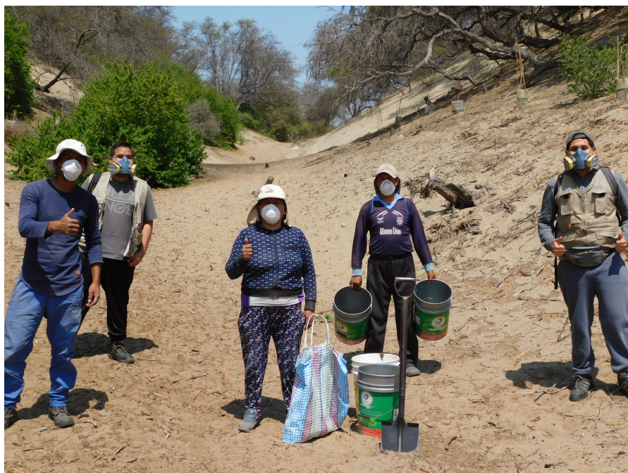
Reforestation during COVID