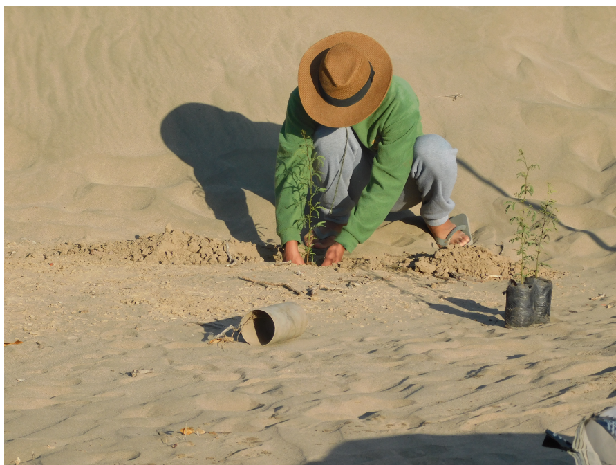
Reforestation

The La Libertad Dry Forest Project recommenced some of its field activities at the Pacasmayo site in August. We prioritised first and foremost, the safety and well-being of all staff and the local community, implementing COVID-19 protocols and government regulations for the team to rigorously follow. The project remains committed to achieving our goals and objectives. Key highlights include: